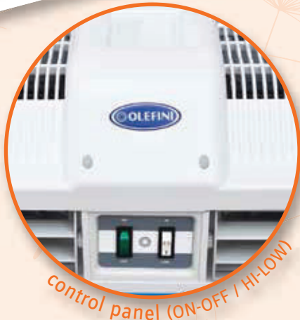
control panel (ON-OFF / HI-LOW)