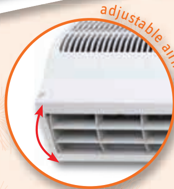
adjustable air flap