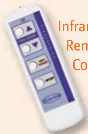
Infrared Remote Control