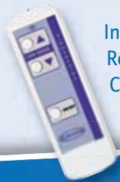
Infrared Remote Control